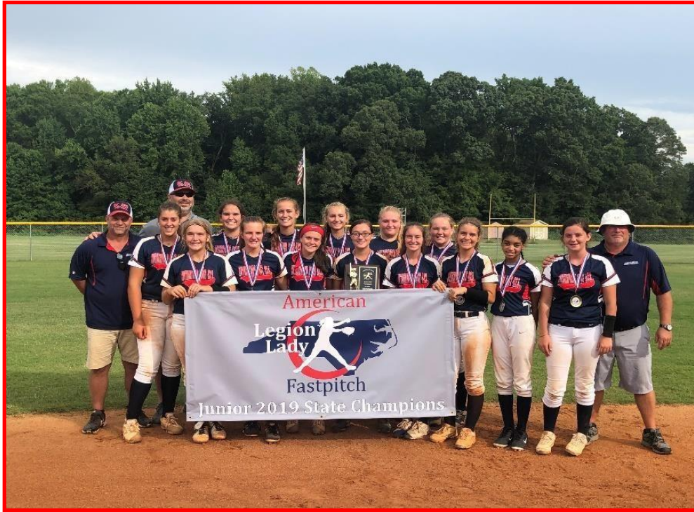
2019 NC American Legion Lady Fastpitch Softball Junior State Champions (Rutherford County Post 423) at the NCALLF Softball Department Championships in Shelby, NC.